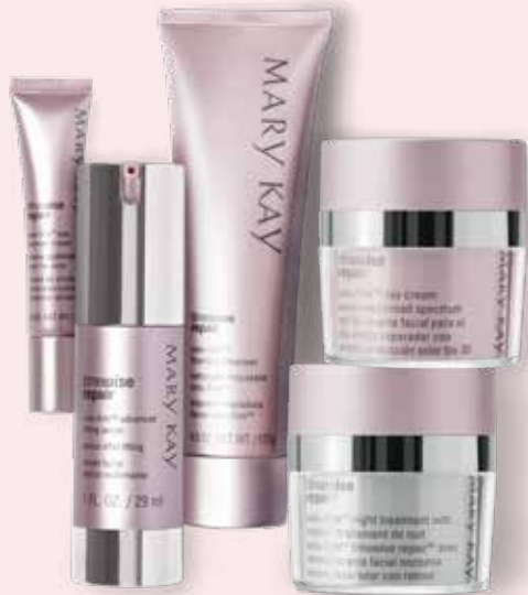
ADVANCED SIGNS OF AGING SOLUTIONS